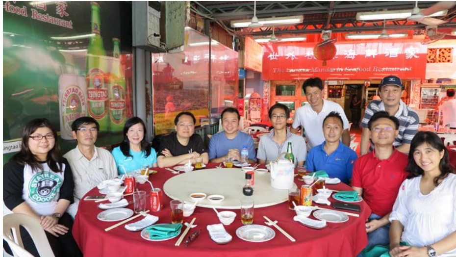
Hiking team at Lamma Island

There were a total of 2 social functions carried out. On 15 Nov 2014, 11 participants walked in Lamma Island from Yung Shue Wan to So Kwu Wan. During the two hours journey, participants enjoyed very much shopping, traditional snacks and followed by a rewarding seafood lunch.