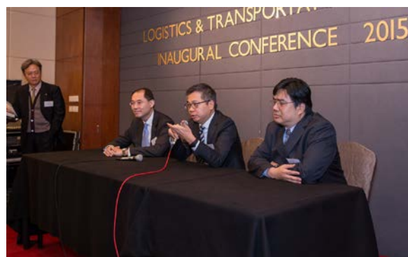
Q&A at Conference