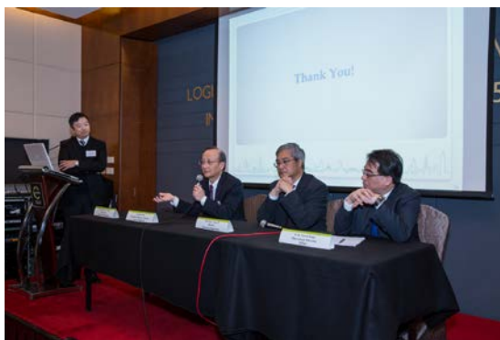
Q&A at Conference