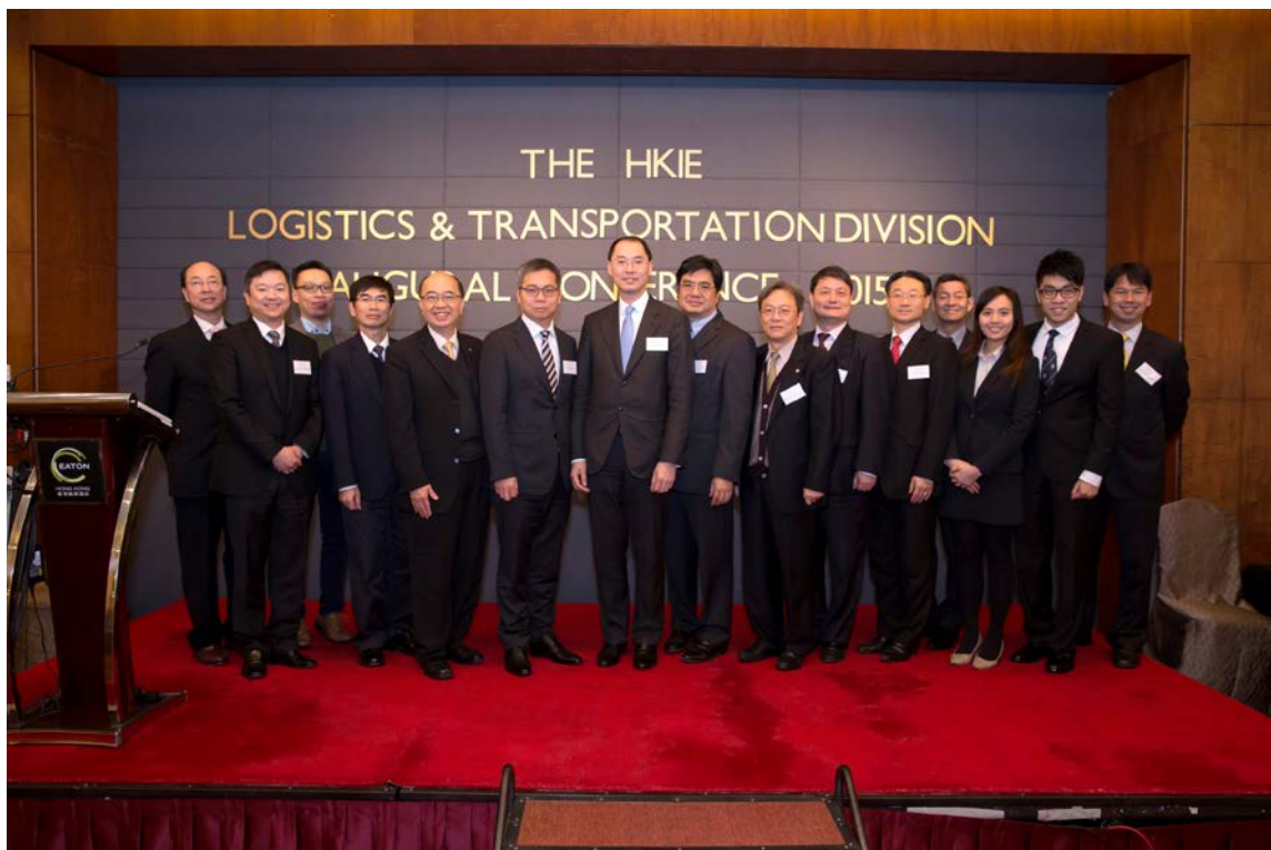
Group Photo after Conference