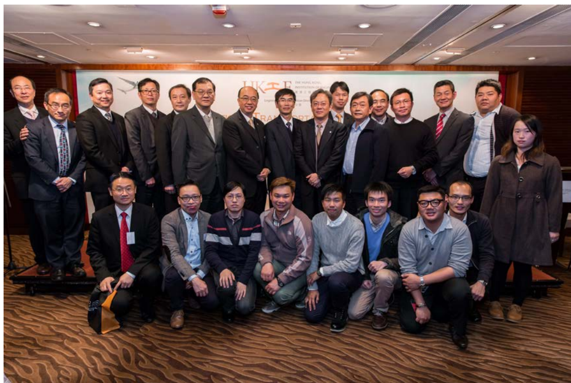
Group Photo after Dinner